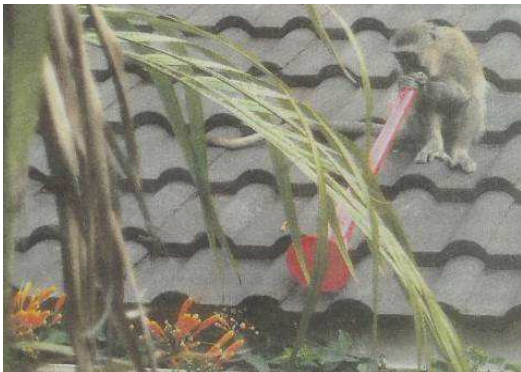
Vervet vuvazela monkey in Amanzimtoti

Only after the last tree has been cut down Only after the last river has been poisoned Only after the last fish have been caught Only then will you find that Money cannot be eaten CREE INDIAN PROPHECY