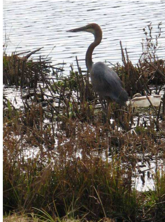
Goliath Heron photographed on Flamingo Dam in front of the Modderfontein Post Office, in a 'high traffic' area.