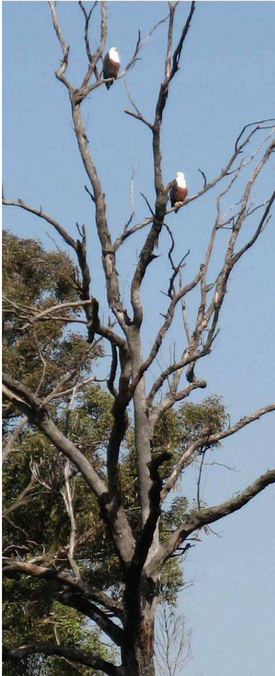
The pair of African Fish Eagles that visitors to the Nature Reserve have been seeing alongside the road near Fish Eagle Dam throughout the winter months.