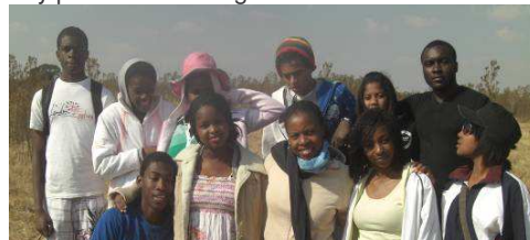
... the St Catherines group

"A picnic back at Fish Eagle Dam rounded off a very pleasant morning."