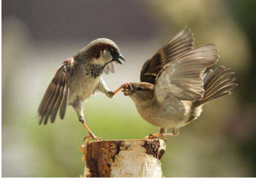
Pat van Nierop shares this one with us: "Soms praat 'n vrou net te veel!!!"