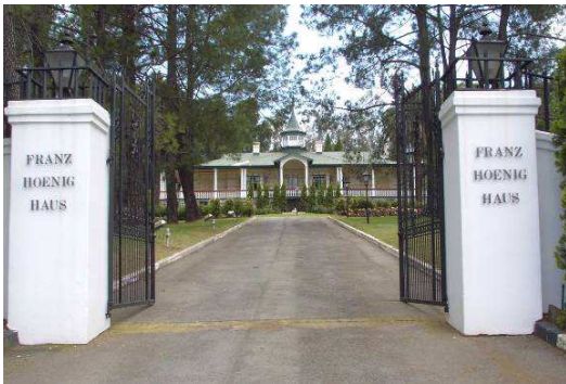
Entrance to Franz Hoenig Haus from the south side

The cost of the tour is R20. To book, contact Robbie on 011 608 2693 or 082 800 3704.