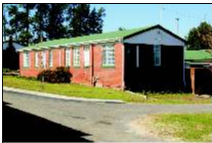
2 WWII BARRACKS - (2.1) WEST