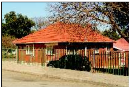
17 HOUSE DOUGLASS (17.1)