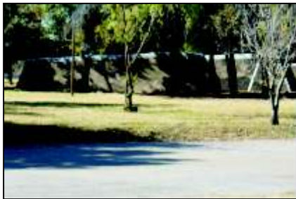
12 MAGAZINES (EXPLOSIVES STORAGE) (12.1)