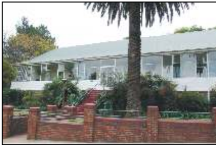
26 B.3DUCKS(B.000) MALE, (26.1) LATER LADIES SINGLE QUARTERS