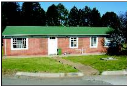
1 VICTORIAN IMITATION (1.1) ORIG. WWII STRUCTURE