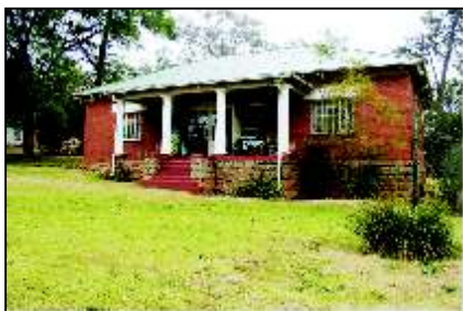
3 HOUSE BROWN (3.1)