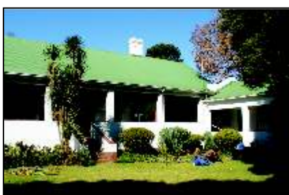
25 HOSPITAL (25.1)