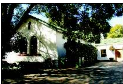
19 CATERING MESS (19.1)