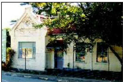
6 THE BAKERY AND ANCILLARY STRUCTURES (6.1)