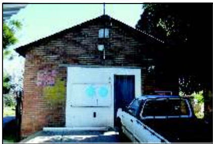
7 GOLFCLUB OUTBUILDINGS (7.1)