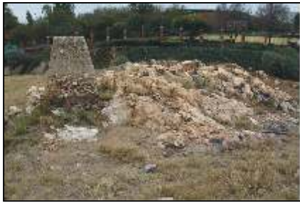
31 FLAGPOLE KOPPIE (31.1)