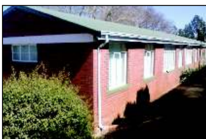
4 WWII COLONEL'S HQ - (4.1) CENTRAL