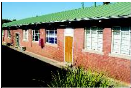
8 CENTRAL BLOCK (8.1)