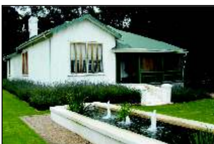
20 FIREMASTER'S HOUSE AND FOUNTAIN (20.1)