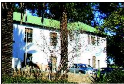
13 BUCKINGHAM HALL (13.1)