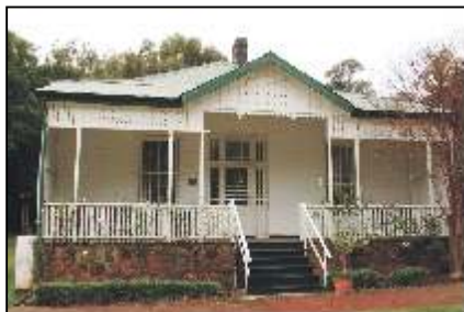
22 HOUSE TABERNER (22.1)