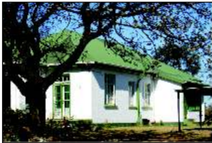
7 MEDICAL PERSONNEL 6 (7.1)