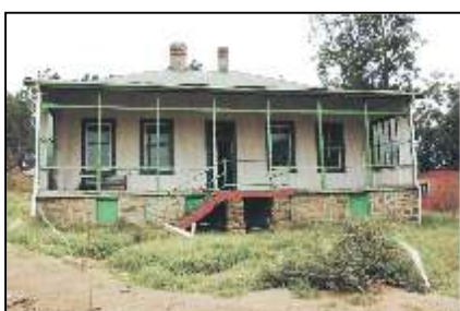
5 MIXED PICKLES COOPER (5.1)