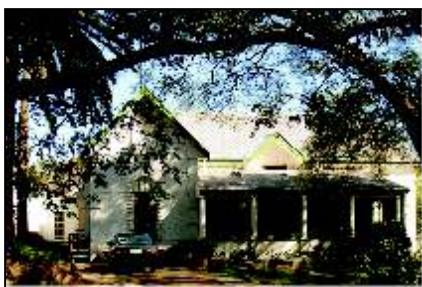
3 HOUSE WALLACE (3.1)