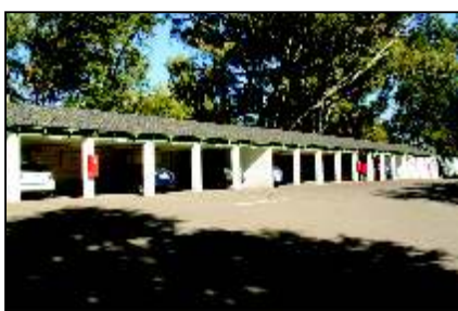
14 BUCKINGHAM GARAGE BLOCK (14.1)