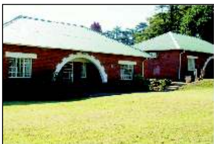
8-15 HIGH STREET ARTISANS HOUSING (8.1)