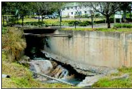
11 NOBEL BRIDGE (11.1)