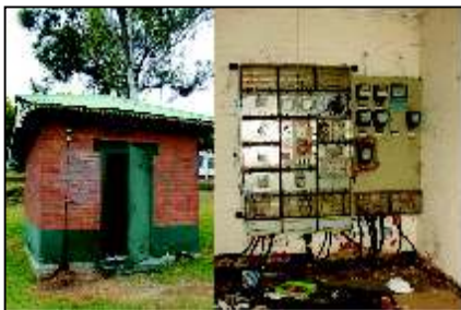
27 TENNIS COURT (27.1) ELECTRICAL SUBSTATION