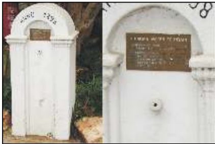
32-34 DRINKING FOUNTAIN (33.1)