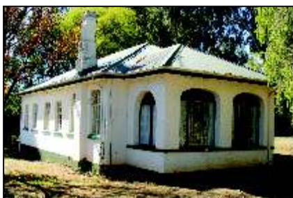
9 MEDICAL PERSONNEL 9 (9.1)