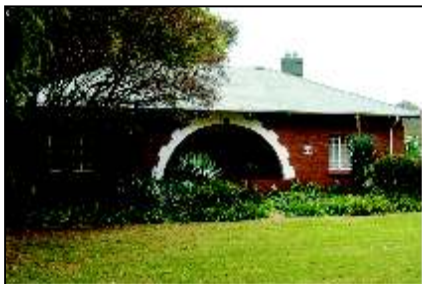
4-5 TWO SINGLE-DETACHED UNITS (4.1)