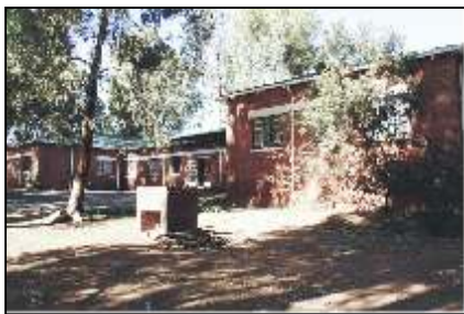
17 MENS SINGLE QUARTERS (17.1)