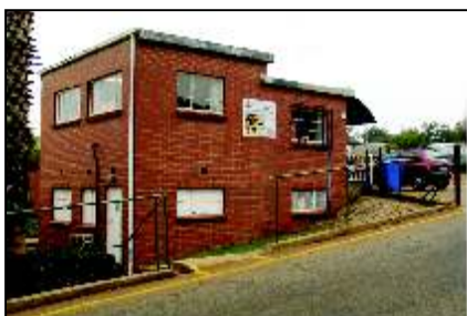
9 CATERING ANNEXE (9.1)