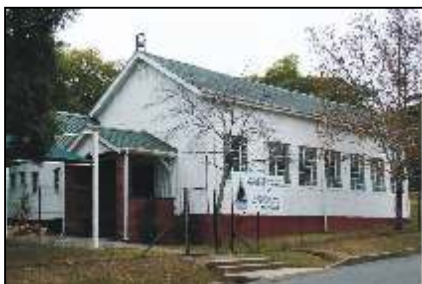
28 INTERDENOMINATIONAL (28.1) CHURCH