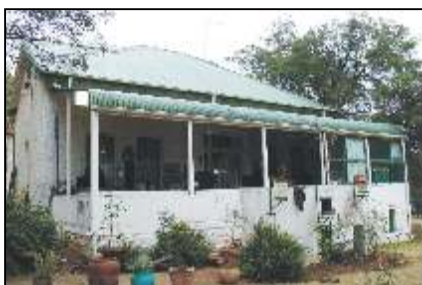
4 MIXED PICKLES BROWN (4.1)