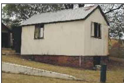
30 HOUSE KING - OUTBUILDING (30.1)