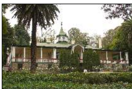
25 FRANZ HOENIG HAUS (25.1)