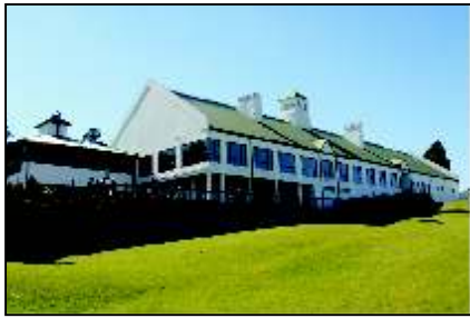
6 MODDERFONTEIN GOLFCLUB (6.1)