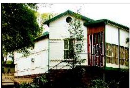
29 HOUSE KING (29.1)