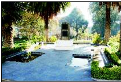
16 WORLD WAR MEMORIAL (16.1)