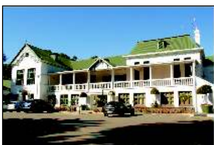
20 THE CASINO (20.1)