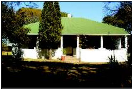
6 MEDICAL PERSONNEL 6 (6.1)