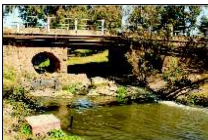
14 ITALY BRIDGE (14.1)