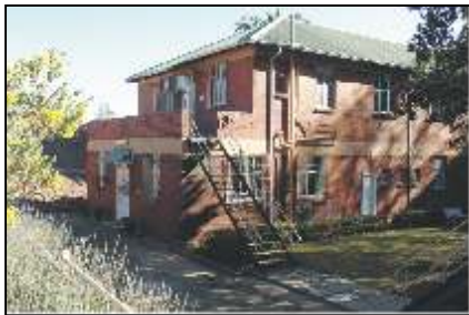
27 NEW HOSPITAL WING (27.1)