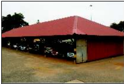
11 WWII OPEN SHED (11.1)