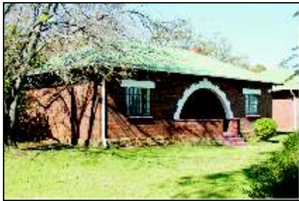
1-3 THREE SINGLE-DETACHED UNITS (1.1)