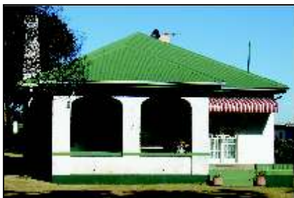
8 MEDICAL PERSONNEL 6 (8.1)