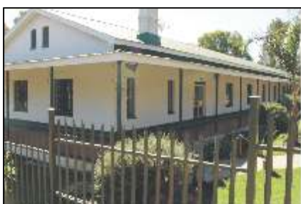
4 B9 BACHELORS QUARTERS (4.1)