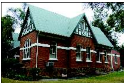
18 VELDHEIM SEMIS (18.1)