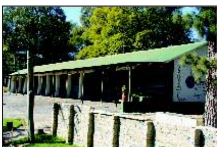
5 B9 BACHELORS QUARTERS OUTBUILDING (5.1)