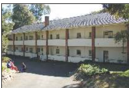
15 MARRIED STAFF FLATS (15.1)