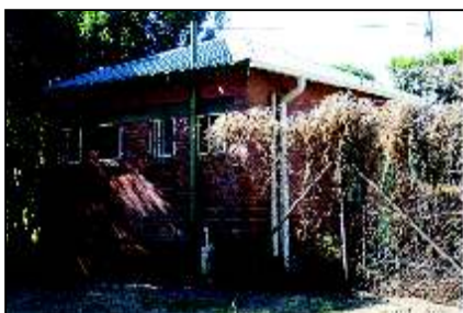
29 OUTBUILDING (29.1)