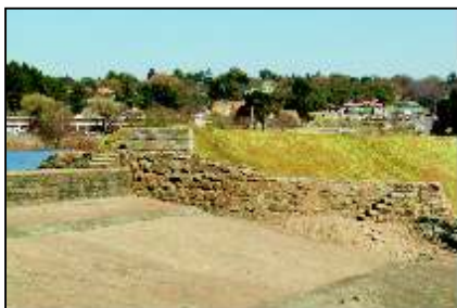
13 ORIGINAL DAM 1 WEIR (13.1)