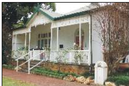
23 THE DYNAMITE COMPANY MUSEUM (23.1)