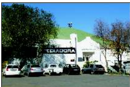
30 MODDERFONTEIN SPORTS CLUB (30.1)