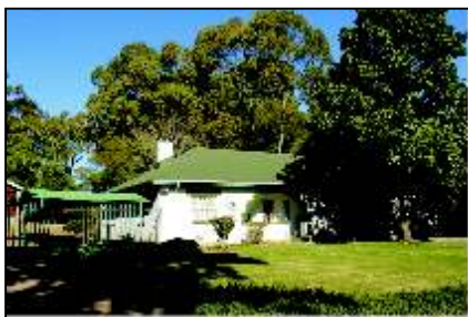
18 HOUSE ROE (18.1)