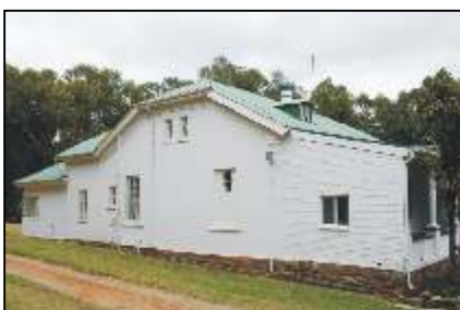
19 LANCASTER HOUSE (19.1)