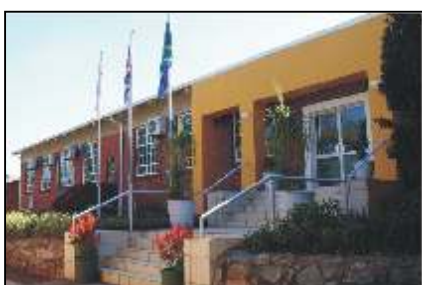
10 EMBANKMENT BLOCK (10.1)