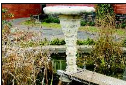
5 WWII BIRDFOUNTAIN - (5.1) CENTRAL