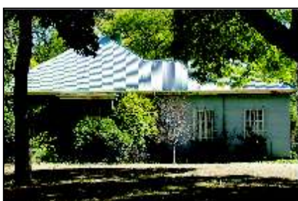
10 MEDICAL PERSONNEL 10 (10.1)