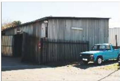
8 GOLFCLUB SHEDS (8.1)