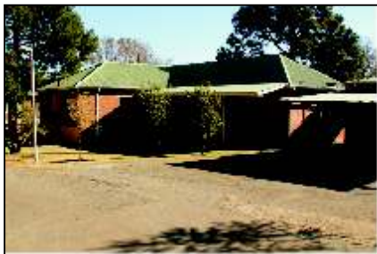
28 HERITAGE CHRISTIAN COLLEGE SCHOOL (28.1)