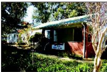
23 HOSPITAL ANNEXE (23.1)