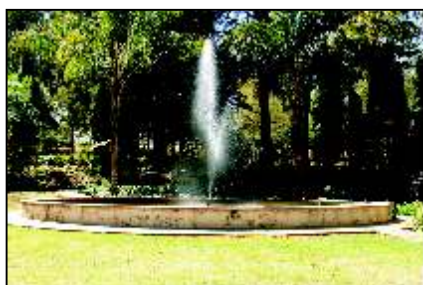
24 FRANZ HOENIG FISHPOND (24.1)