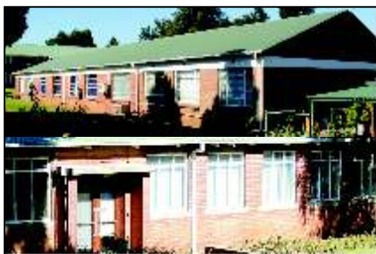
3 WWII OFFICES - (3.1) CENTRAL