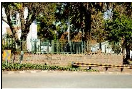
12 STONES WALL (12.1)