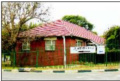
16 HOUSE QUATRILL (16.1)