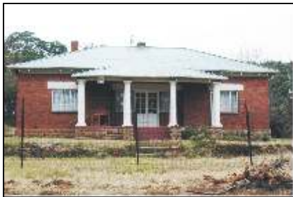
2 HOUSE KNIGHT (2.1)