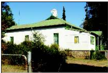
2 COPEMANS CORNER (2.1)