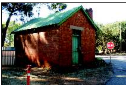
24 MORTUARY AND COAL STORE (24.1)