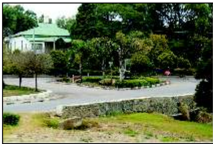
1 CHRISTIES BRIDGE (1.1)