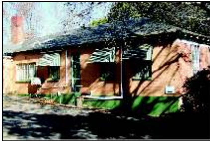
26 NEW DOCTORS ROOMS (26.1)