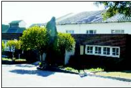
21 NEW TOWN HALL (21.1)