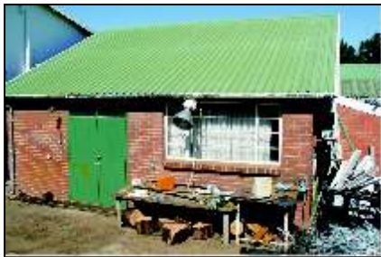
7 STOREROOM (7.1)