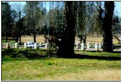
1 ANTWERP BRIDGE (1.1)