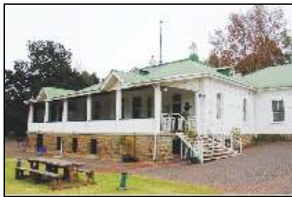
21 33 HIGH STREET AND OUTBUILDING (21.1)