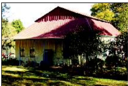
7 HAMMERS GROCERY AND GENERAL STORE (7.1)