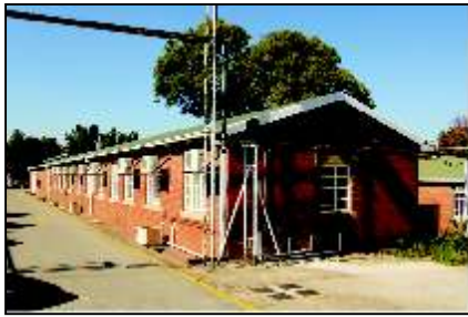
6 POST WAR CHEMICAL RESEARCH AND DEVELOPMENT - EAST (6.1)