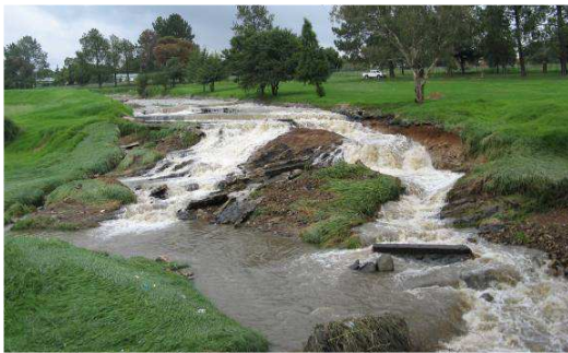
Water cascades down from the spillway of Dam 1

What was even more shocking is people's reaction to flooded areas. What on earth were they doing trying to cross a flooding bridge in heavy rain, a bridge, which anyone who lives or works here knows, floods every time there is heavy rain. The sheer stupidity of their actions is beyond belief. By being so stubborn they put themselves at risk as well as the rescue team that had to come to drag them to safety.