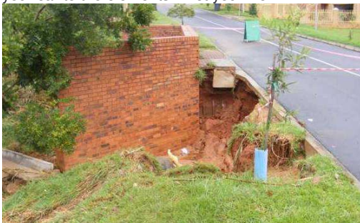
Damaged bridge in Thornhill Estate

So next time you are driving in the area with heavy rain, stick to the main road into Thornhill or risk losing your car to the elements if not your life.