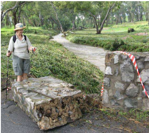
Tricia Llewellyn surveys some of the damage