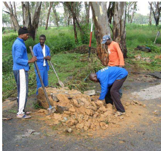
Workers begin repairing Stone Bridge