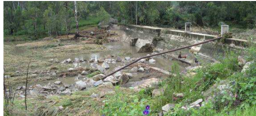
Below the wall of Dam 3a