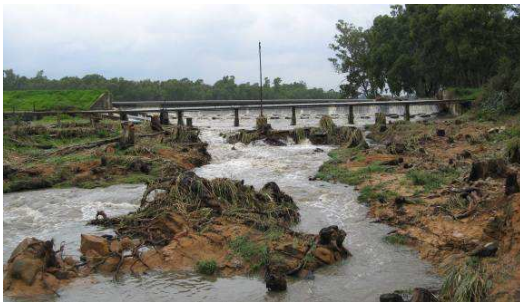
Below the wall of Dam 3