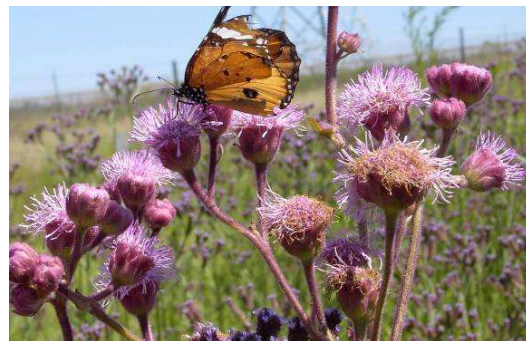
The dreaded weed in the Nature Reserve

It is believed that this plant was a garden escapee. Next time you are tempted to smuggle some seeds into South Africa, THINK TWICE. Remember that those same seeds could become a huge problem for the environment, so resist the temptation.